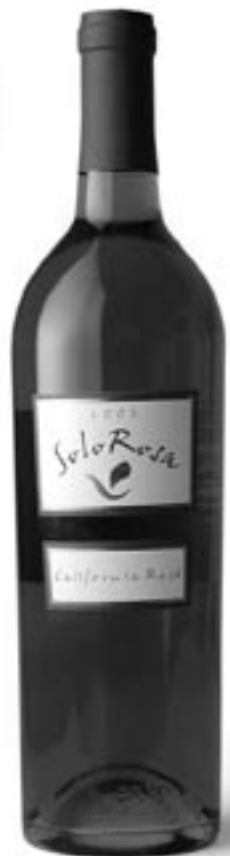
2002 SOLO ROSA ROSE, California $10.97 NET

I am sorely tempted to open this wine for Thanksgiving this year. It's everything you could hope for in a holiday wine. It can do service as either a red or a white and everyone from your scotch-loving grandpa to your most wine-geeky cousin will love it. And it'll handle anything that ever appears on the traditional Thanksgiving table with ease. Bone-dry but deeply fruited and buttressed by great acidity, it's a cut above most else we find out there.