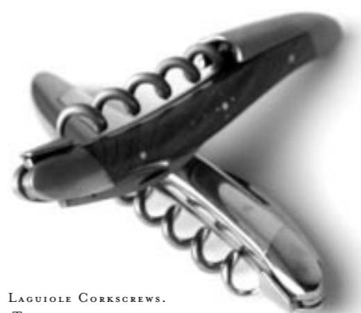
LAGUIOLE CORKSCREWS. TOP QUALITY FINISHES, prices vary by item.

We all know that Castelnuovo Berardenga will someday have its own DOCG within Tuscany and that Fattoria Felsina will be its premier property. It already has that distinction within the much larger Chianti Classico appellation even though its wines are hardly typical. (Then again, is Latour typical Pauillac?) Fontodi, on the other hand, is definitely the Grand Cru of Panzano, right in the heart of Classico. Together they are a fascinating study in terroir, the Felsina representing elegance and style and the Fontodi, brawn. They are both state-of-the-art in Tuscany. A half case of each is called for here. At least.