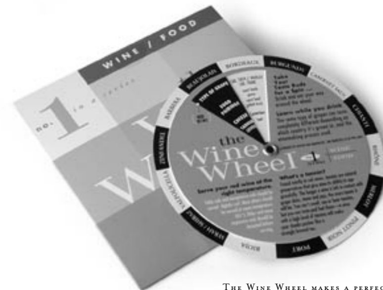
THE WINE WHEEL MAKES A PERFECT GIFT FOR ANY WINE LOVER. $5.95

NV PAUL BARA BRUT GRAND ROSE Champagne $34.50 NET