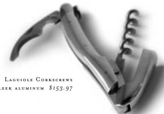
LAGUIOLE CORKSCREWS IN SLEEK ALUMINUM $153.97